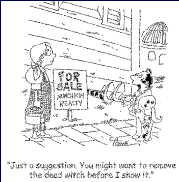
"Just a suggestion. You might want to remove the dead witch before I show it."